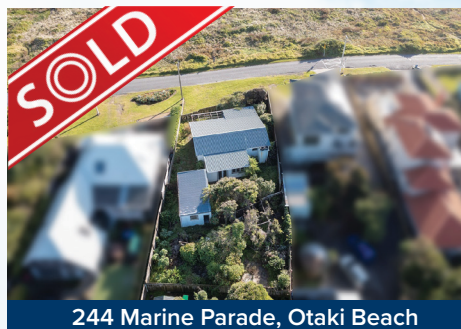
244 Marine Parade, Otaki Beach