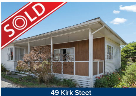
49 Kirk Steet