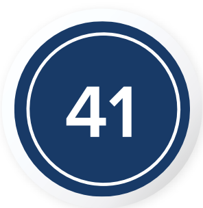
Days to Sell