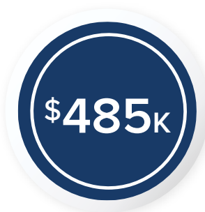
Median Sale Price

STATISTICS BASED ON REINZ DATA FROM THE PREVIOUS 12 MONTHS AS OF 29 NOV 2024