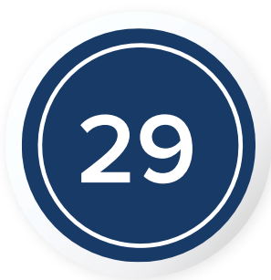
Days to Sell