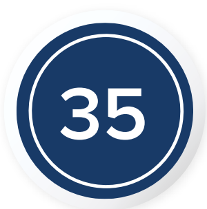
Days to Sell