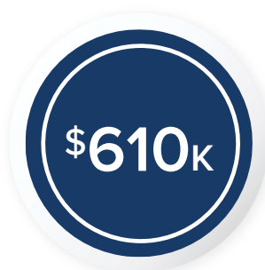
Median Sale Price

STATISTICS BASED ON REINZ DATA FROM THE PREVIOUS 12 MONTHS AS OF 29 NOV 2024