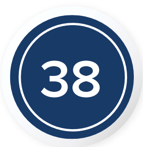
Days to Sell