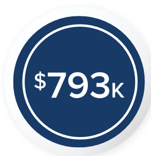
Median Sale Price

STATISTICS BASED ON REINZ DATA FROM THE PREVIOUS 12 MONTHS AS OF 29 NOV 2024