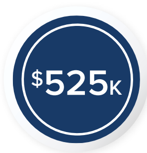
Median Sale Price

STATISTICS BASED ON REINZ DATA FROM THE PREVIOUS 12 MONTHS AS OF 29 NOV 2024