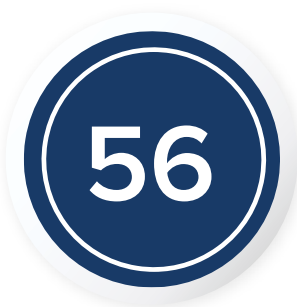
Days to Sell