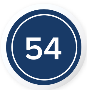
Days to Sell