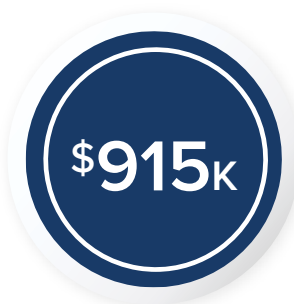
Median Sale Price

STATISTICS BASED ON REINZ DATA FROM THE PREVIOUS 12 MONTHS AS OF 29 NOV 2024