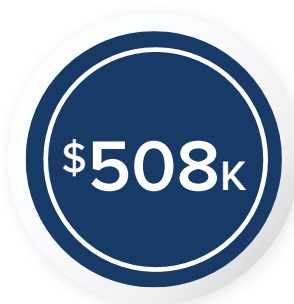
Median Sale Price

STATISTICS BASED ON REINZ DATA FROM THE PREVIOUS 12 MONTHS AS OF 29 NOV 2024