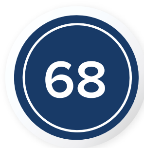
Days to Sell