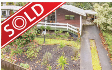
69a Anzac Parade