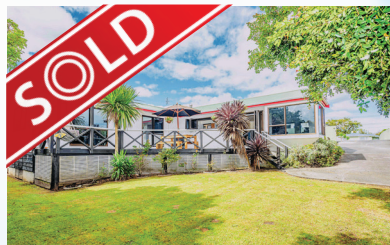
38a Toi Street