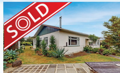
6 Taranaki Street